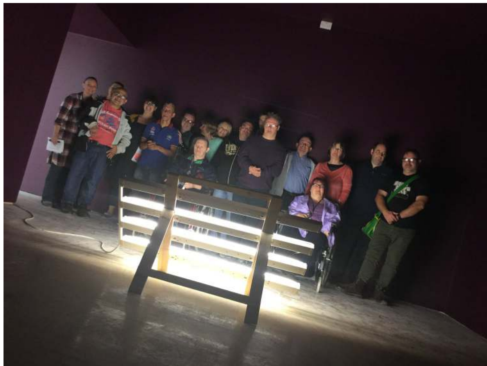
The Eden Group backstage at Leeds Art Gallery, preparing for British Art Show 8

Discover Groups are open to people who may not have had any experience of participatory arts before. We don't expect any prior knowledge and people learn as they go, entirely at their own pace. We do projects, not 'courses'; there is no pressure to achieve a particular learning outcome and our measure of success is someone's level of enjoyment and engagement with the arts, not the work that they produce.