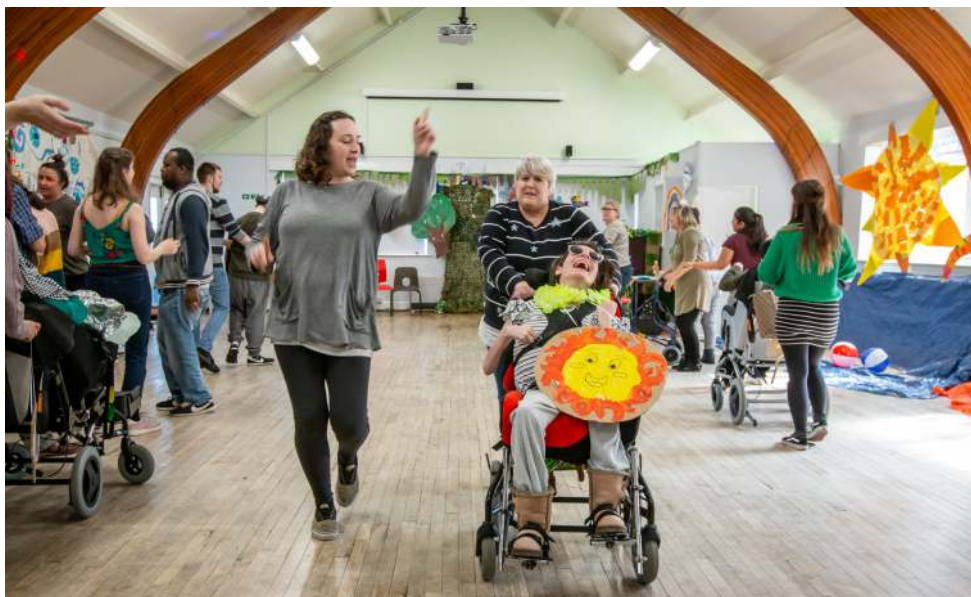
The High Rise Movement Group

Every project is led by a professional freelance Arts Facilitator and a Pyramid Core Worker, who has been trained by us in inclusive arts practice. The Core Worker makes sure every member is able to participate in sessions to the fullest of their ability. Each group also has a Supporting Arts Facilitator so we can ensure every member gets enough individual staff time and attention. Groups are further supported by a team of trained arts volunteers.