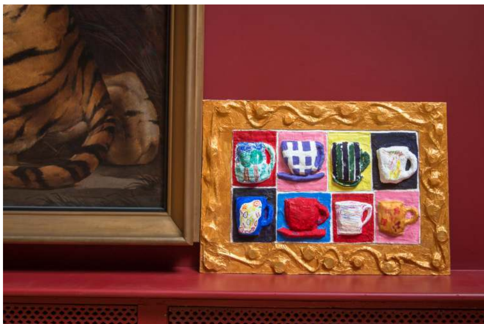
The Pyramid View on Leeds Art Gallery, Legends Group

Every project is led by a professional freelance Arts Facilitator with expertise in the chosen artform (e.g. sculptor, dancer, film-maker) and a Pyramid Core Worker, who has been trained by us in inclusive arts practice. The Core Worker makes sure every member is able to participate in sessions to the fullest of their ability. Groups are further supported by a team of trained arts volunteers.