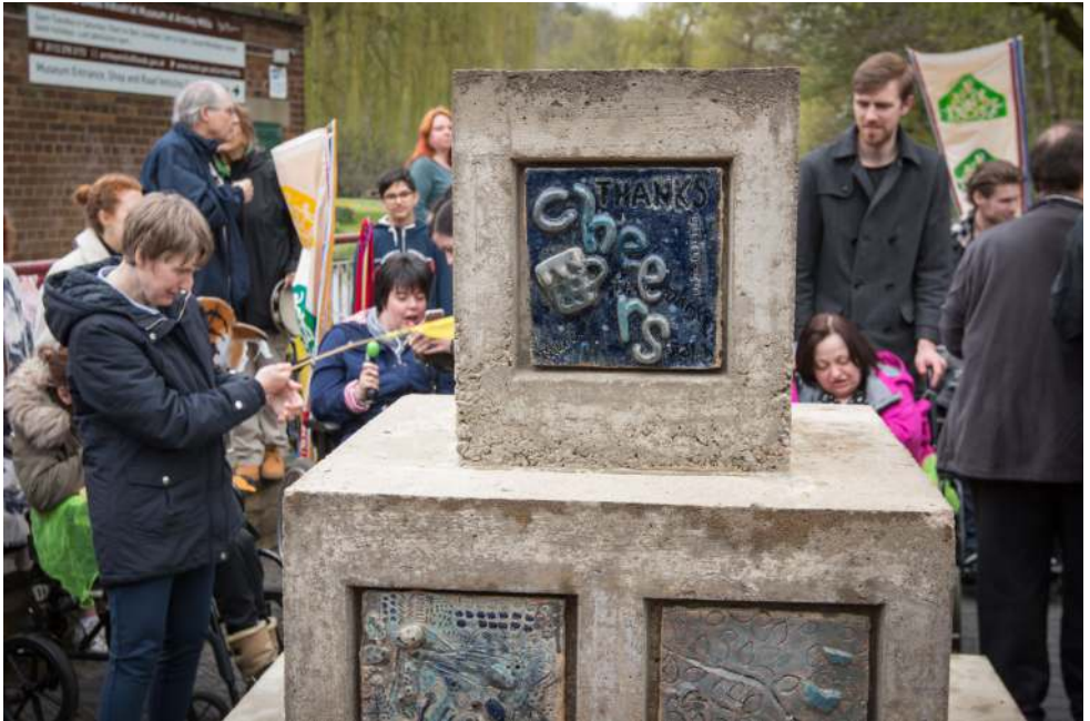
Permanent sculpture at Leeds Industrial Museum, by High Rise Visual Arts

High Rise groups are focused on particular artforms. We currently run a music group and a movement group. When someone joins a High Rise group, we spend time getting to know them, using techniques such as Intensive Interaction. Our groups are not time-limited. We see great outcomes for members because small changes in responses and behaviour can be recognised and built on, as understanding and trust develops.